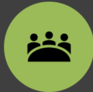
PHI DELTA EPSILON