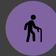
STUDENTS TO SENIORS

Learn more on Northeastern's Engage Website .