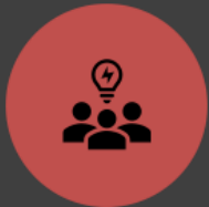
ALPHA EPSILON DELTA