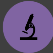
BETA BETA BETA