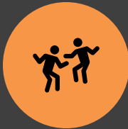
PEACE THROUGH PLAY