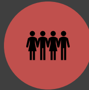
BOSTON HEALTH INITIATIVE (FORMERLY PHE)