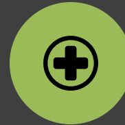
NU RED CROSS