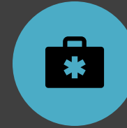
GLOBAL MEDICAL & DENTAL BRIGADES