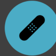
GLOBAL PUBLIC HEALTH BRIGADES