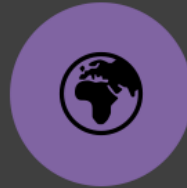
HEALTH DISPARITIES STUDENT COLLABORATIVE