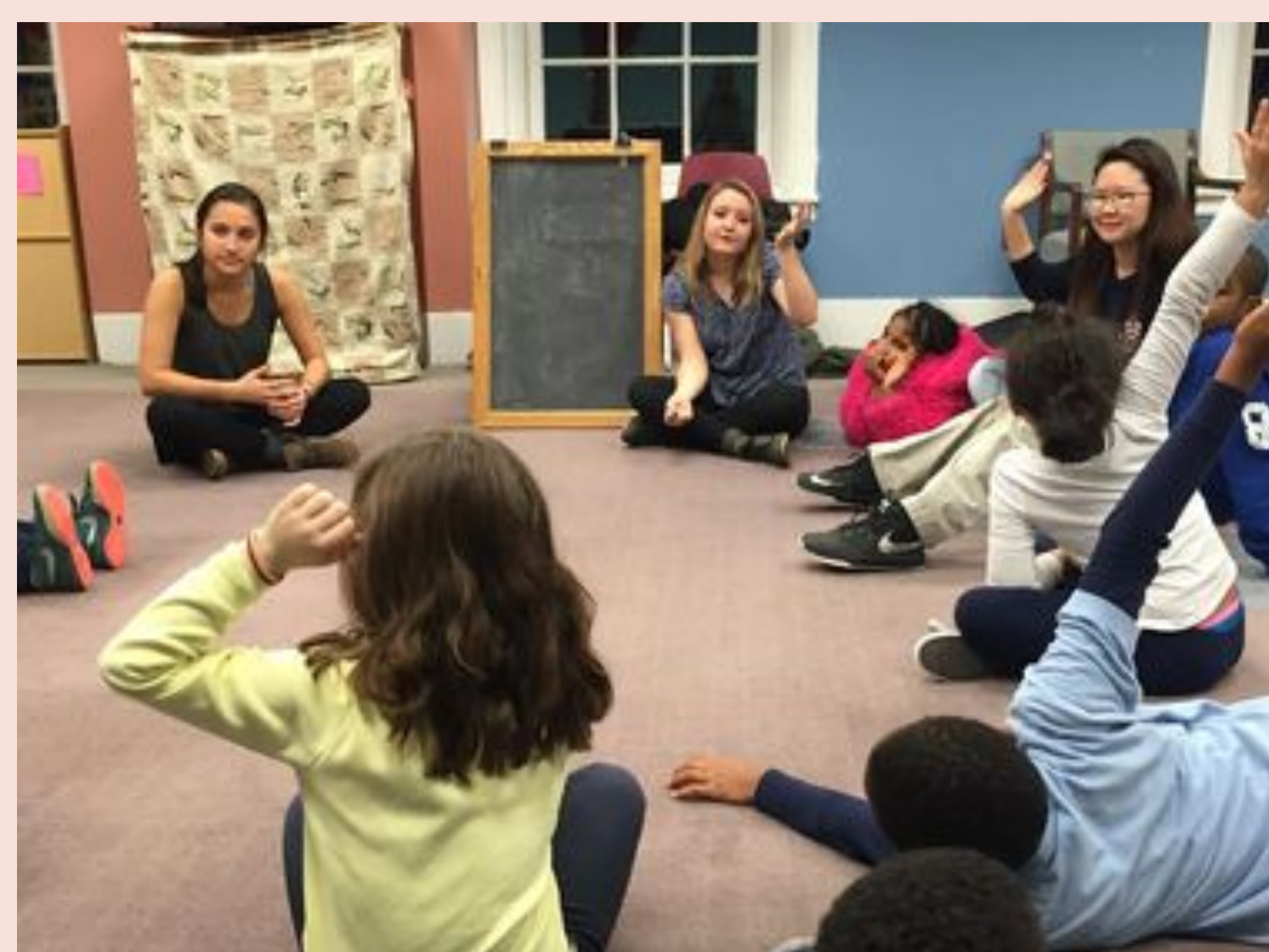
Roxbury Rocks! lessons encourage reflection and discussion