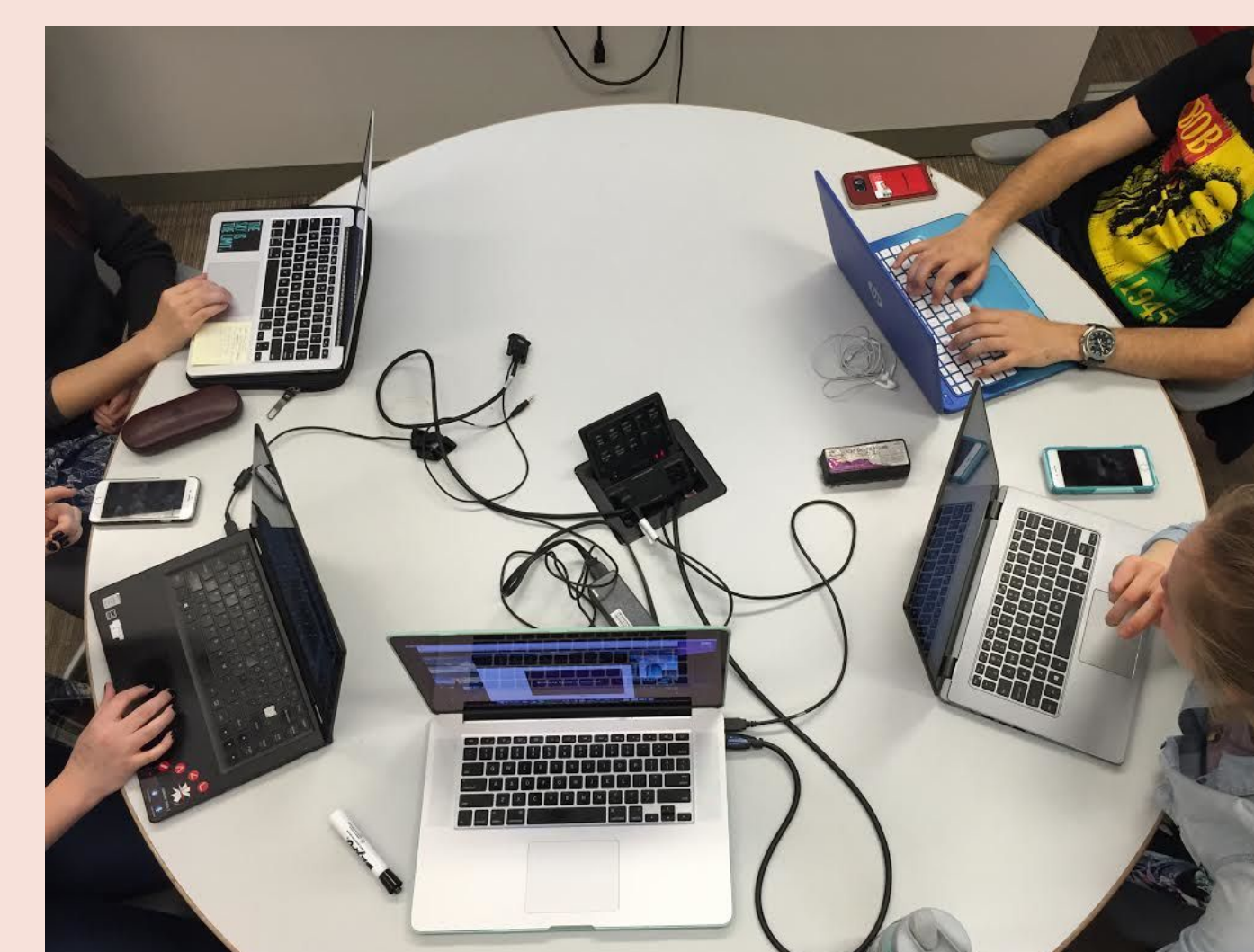
The board hard at work...